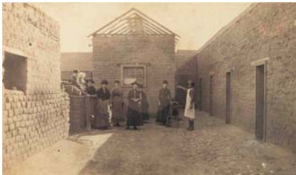
Ladies and cook in Zagan, circa 1890.