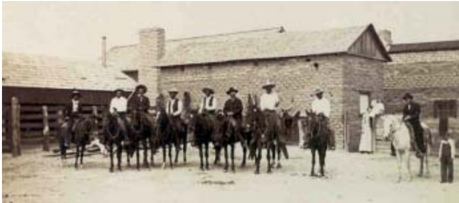
Empire Ranch Vaqueros circa 1890